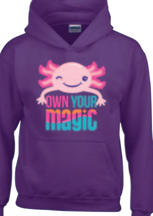
Hoodie 900+ packages

All girls that sell Girl Scout cookies earn patches regardless of the proceeds plan they chose. Patches can be sewn or ironed on uniforms. Just check out the vests and sashes of other Girl Scouts and you'll see how long they've been selling cookies and how many boxes they've sold each year!