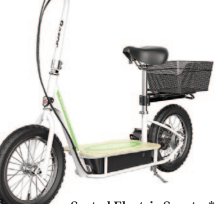
Seated Electric Scooter* 4,000 to 4,999 packages

Girls must pay their cookie bill in full by the deadline set by their troop in order to be eligible for top seller awards, Superstar Destinations, Cookie Dough, and recognitions over 999 packages.