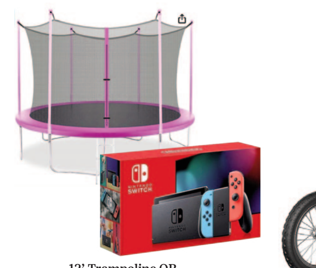
12' Trampoline OR Nintendo Switch* 3,500 to 3,999 packages

Wireless Beats Headphones* 3,000-3,499 packages