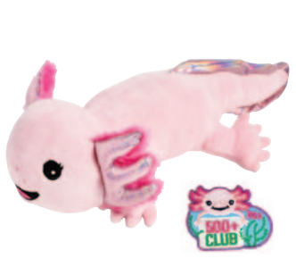
Small Plush Axolotl & 500+ Club Patch 500+ packages