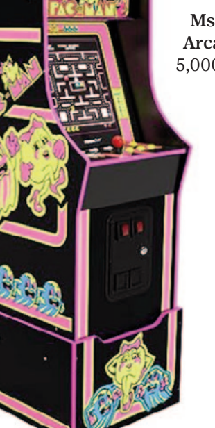
Ms. Pac Man Arcade Game* 5,000+ packages

* Items/colors are subject to change due to availability