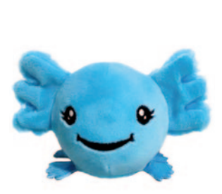
PBJ Plush Axolotl 300+ packages