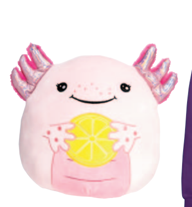
Axolotl Squish Mallow 800+ packages