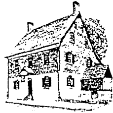
WINKLER BAKERY, 1800

1 pound light brown sugar 6 ounces margarine 6 ounces shortening 1 quart Molasses (Puerto Rican, which is very dark) 2 rounded tablespoons soda ½ cup boiling water 4 pounds flour (approx.) 2 tablespoons cloves 2 tablespoons ginger 2 tablespoons cinnamon