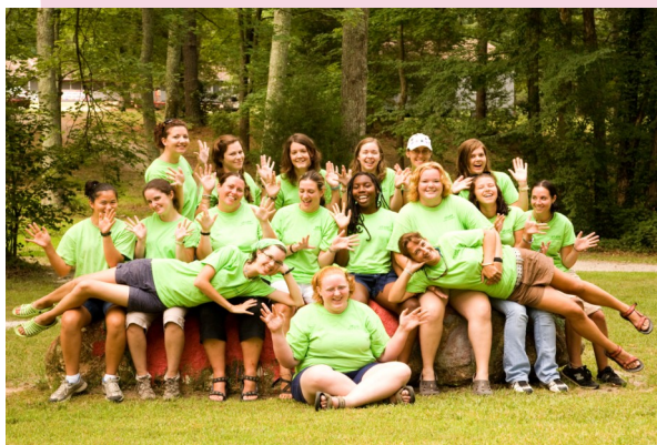
2009 Summer Camp Staff

* Sessions 4, 5, and 6 have a unit of boys and girls attending through Camp Kaleidoscope with Duke University